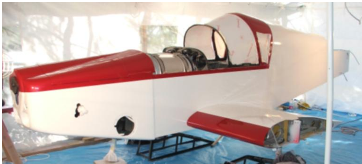
Glenda Faint's Tinnie 2 in the paint shop as work progresses.