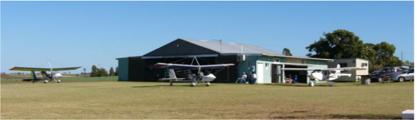
The flying school hangar with Drifters and a Terrier at Bange's Airfield.